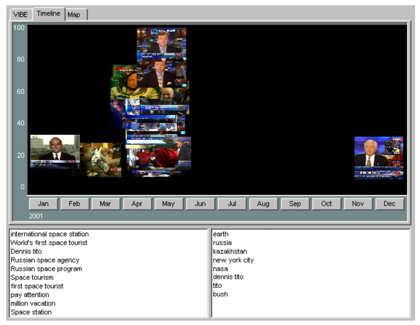
Figure 7. Collage generated from 20 video documents returned from "Dennis Tito" query.