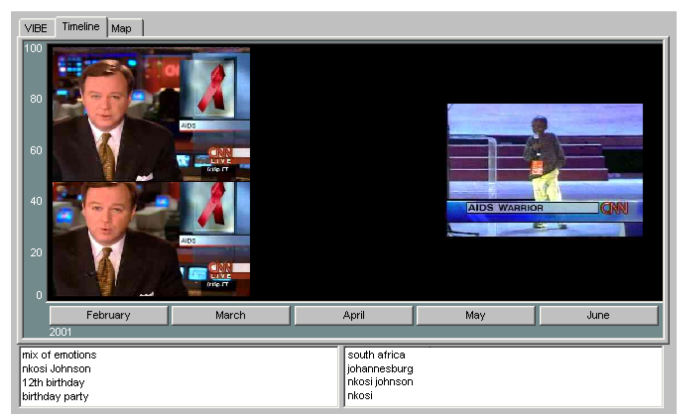
Figure 6. Collage generated from 4 video documents returned from "Nkosi Johnson" query (y-axis on timeline is relevance).