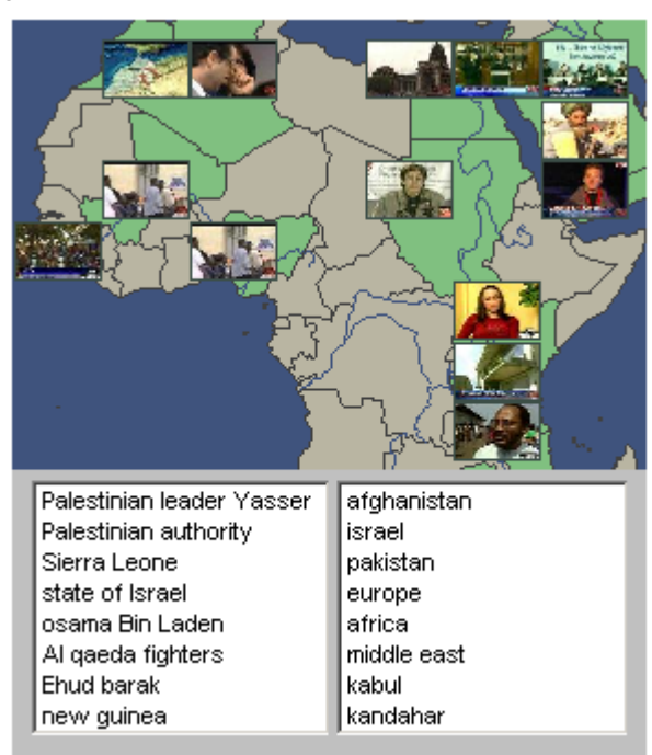
Figure 1. Map collage, with common phrases and frequent locations for documents pertaining to Africa.

Consider a user interested in finding geographic distribution on reports of political asylum and refugees in 2001 news. Following a query on these words, 126 video documents are returned. At an average of 2 minutes per document, the user would need over 4 hours to examine all of the material, possibly without retaining an overview of how these stories relate to countries in Africa and the Middle East. If this became the subject of inquiry, the user could open up a map collage and use the standard map interface tools of pan and zoom to select to see this region of interest, as shown in Figure 1.