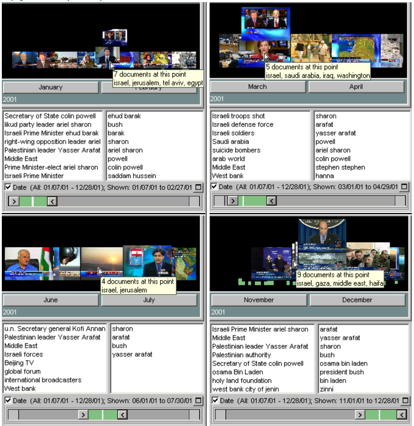
Figure 3. Four-part series showing use of date slider to change the view in the timeline collage, with most common phrases and people listed for all the documents in that date view (tooltips shows locations for the subset plotted at the mouse location).

between true story boundaries and automatically derived video document boundaries leads to errors in the collage, and points to the importance of improving automatic video segmentation. As this is a difficult research area, compromises should also be made in the collage generation process to tolerate segmentation errors, e.g., include text terms in summary lists only if they are repeated across a minimum number or minimum percentage of video documents.