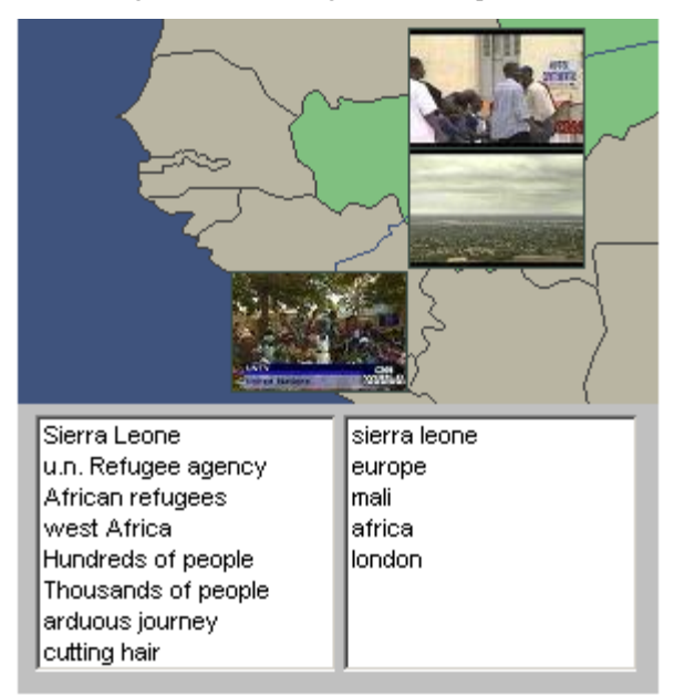
Figure 2. Map collage after zooming into a subset of Africa from the collage shown in Figure 1.

user is reached, with one image per tile, the highest-scoring regions reserving tiles first. Advantages of this approach include images that don't obscure each other, and images are located by the countries they describe. The obvious disadvantage to this approach is that countries with large areas have greater potential to show more images. The overlapping image view used in timeline collages will be investigated with maps as well.