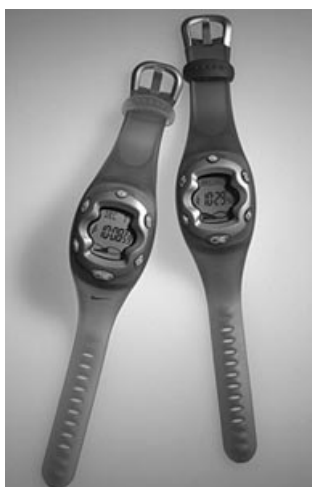
Surf's Up: Pentagram designed Nike's new surfing watch, which stores information on high tides at 150 different beaches.

The baggage was that all computers had to at least look like they were descended from the huge, serious mainframes of the past. To this day, after two decades of personal computing, most computers still borrow their design elements--the drab boxes, the cables, the blinking lights--from mammoth machines that filled air-conditioned rooms in the 1960s. If they weren't serious-looking, they weren't really computers.