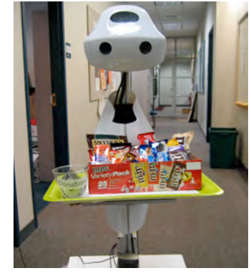
Figure 4. Prototype used for early technology feasibility study.

In terms of software, we learned that it would be feasible to entirely automate the dialogue structure using a finite number of preset phases, because conversation with the robot quickly revealed stable patterns. We also learned that we would need to devise ways to deal with network lag or drop-off and still preserve the idea of a sociable, fluidly interacting robot. This led us to pursue the interaction study described in the next section.