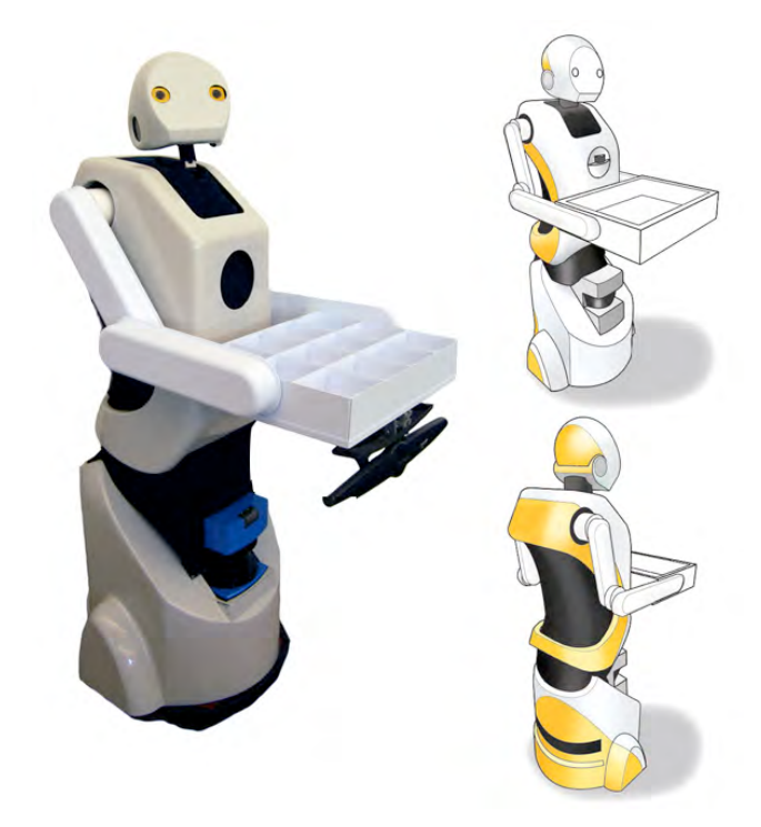
Figure 1. The Snackbot robot.

Experimental systems, including receptionists, assistants, guides, tutors, and social companions, have been developed as platforms for research and technology development [3][4][5][6][8] [10][11][13][14][17][21][25][29][31][33][34]. Much of this work has taken place in the research laboratory, but a few systems have made the successful transition to real world settings such as museums and educational institutions [15][17][22][27][28]. Real world settings raise the bar to fluid, natural interaction with robotic systems.