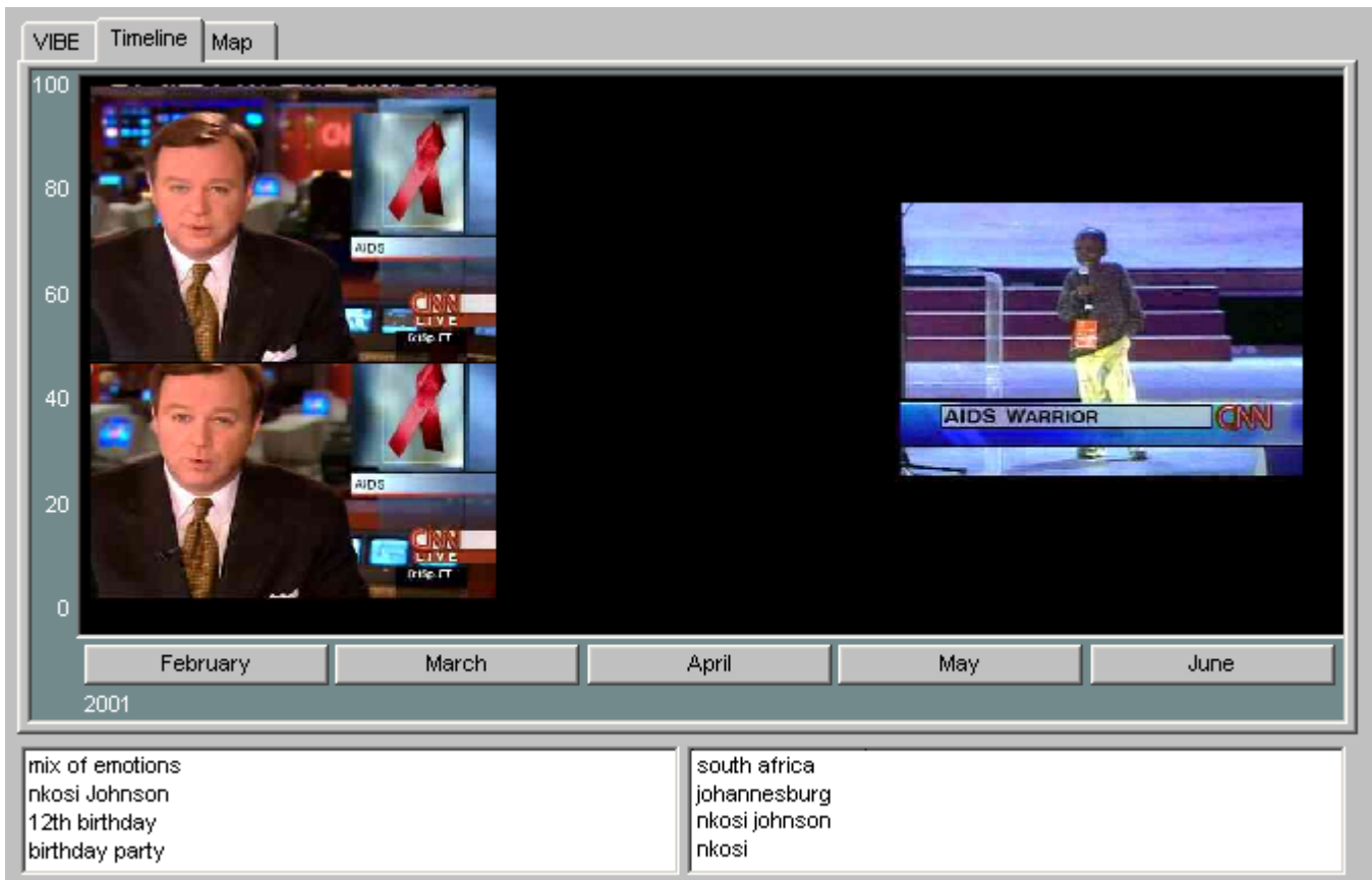
Figure 6. Collage generated from 4 video documents returned from "Nkosi Johnson" query (y-axis on timeline is relevance).