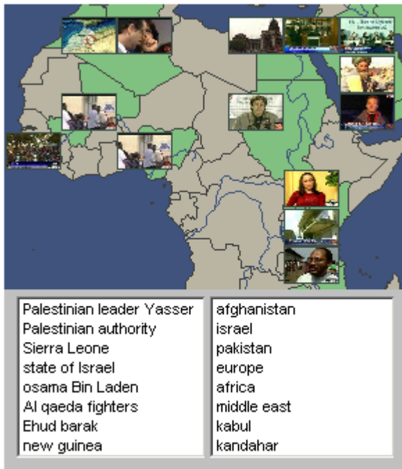
Figure 1. Map collage, with common phrases and frequent locations for documents pertaining to Africa.

Consider a user interested in finding geographic distribution on reports of political asylum and refugees in 2001 news. Following a query on these words, 126 video documents are returned. At an average of 2 minutes per document, the user would need over 4 hours to examine all of the material, possibly without retaining an overview of how these stories relate to countries in Africa and the Middle East. If this became the subject of inquiry, the user could open up a map collage and use the standard map interface tools of pan and zoom to select to see this region of interest, as shown in Figure 1.