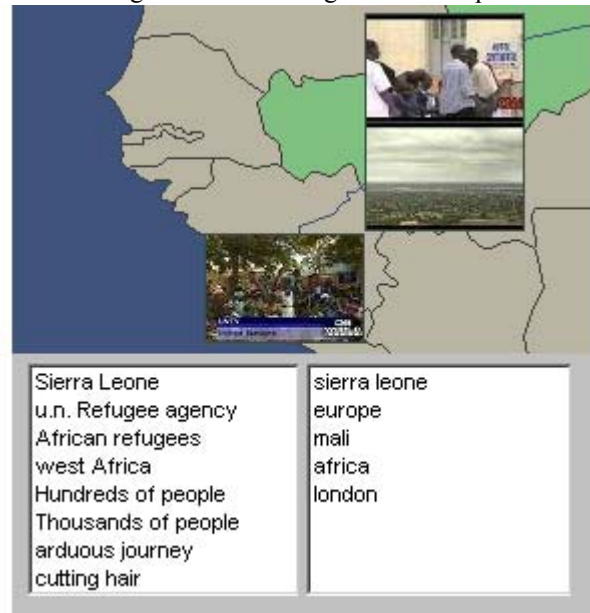
Figure 2. Map collage after zooming into a subset of Africa from the collage shown in Figure 1.

A tiling metric is used to overlay the images on the map collage. A grid is overlaid on the map, and images are displayed in each grid tile intersecting a scoring region until a threshold set by the user is reached, with one image per tile, the highest-scoring regions reserving tiles first. Advantages of this approach include images that don't obscure each other, and images are located by the countries they describe. The obvious disadvantage to this approach is that countries with large areas have greater potential to show more images. The overlapping image view used in timeline collages will be investigated with maps as well.