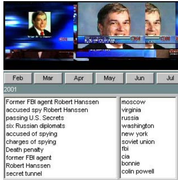
Figure 5. Collage for "Robert Hanssen" from 2001 news set.

Beyond the utility of their text contents as summaries, collages also offer the benefits of folding in imagery and layout, such as seeing a head shot of "Robert Hanssen" in Figure 5. Layout communicates information as well, e.g., seeing the bounds of story reports (February, June) on Nkosi Johnson in Figure 6, and seeing the density of reports on Dennis Tito in May in Figure 7, or seeing geographic distributions via map collages. A straightforward comparison of the collage's text indicates its value as a briefing tool, a value that is enhanced through additional information within the collage. In addition, the collage's interactive nature supports dynamic exploration and revealing of further detail in subsets of interest.